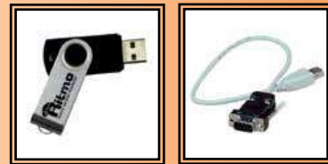
Software Ritmo Transfer