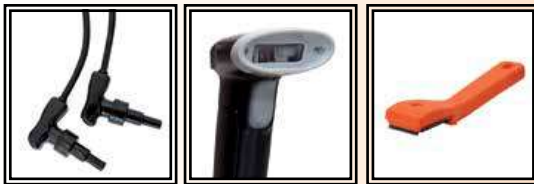
Universal connectors 90°